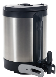
SH SERVER, 1.5G/5.7L INF SERIES