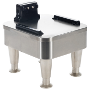
1SH STAND, 120V INF SERIES