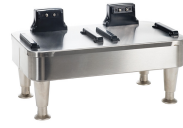
2SH STAND, 120V INF SERIES